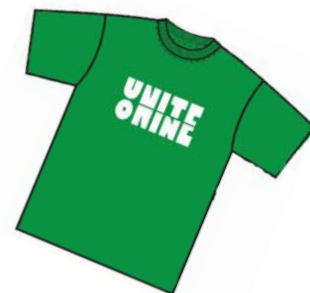
Class of 2009 Gift Committee with President Gutmann Unite ONine Kick Off, September 24, 2008