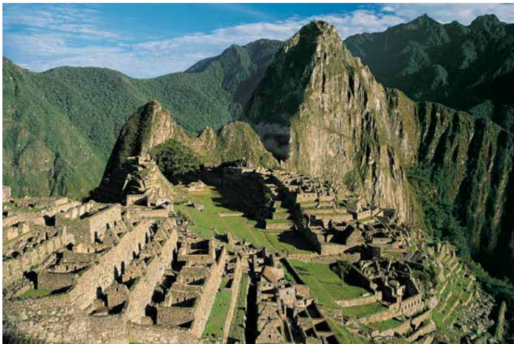
Tour the enigmatic ruins of Machu Picchu.

Day 6: Machu Picchu/Cuzco Today before the day trippers arrive we take our second guided tour of this UNESCO World Heritage site. Then we return to Aguas Calientes for lunch and free time before our mid-afternoon train to Cuzco. B,L