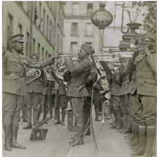
Top: Montmartre | Above: American military band plays jazz for wounded soldiers outside their Paris hospital, 1918

Explore the city that welcomed Josephine Baker, Langston Hughes and other African-American luminaries. See the favorite haunts of Hughes, W.E.B. DuBois and James Baldwin along the Champs Élysées, and drive through the Latin Quarter, so named because this neighborhood was the intellectual hub of Paris for centuries. Stroll through the artsy neighborhood where entertainers and writers from the African-American expatriate community lived, including Henry Ossawa Tanner, Miles Davis and Bud Powell.