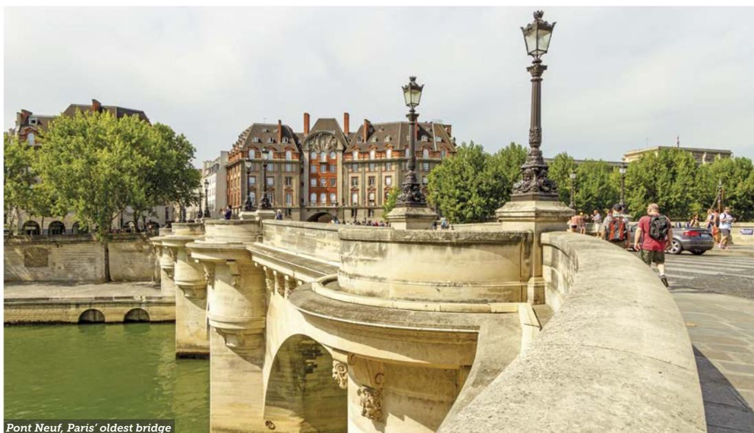
Pont Neuf, Paris' oldest bridge