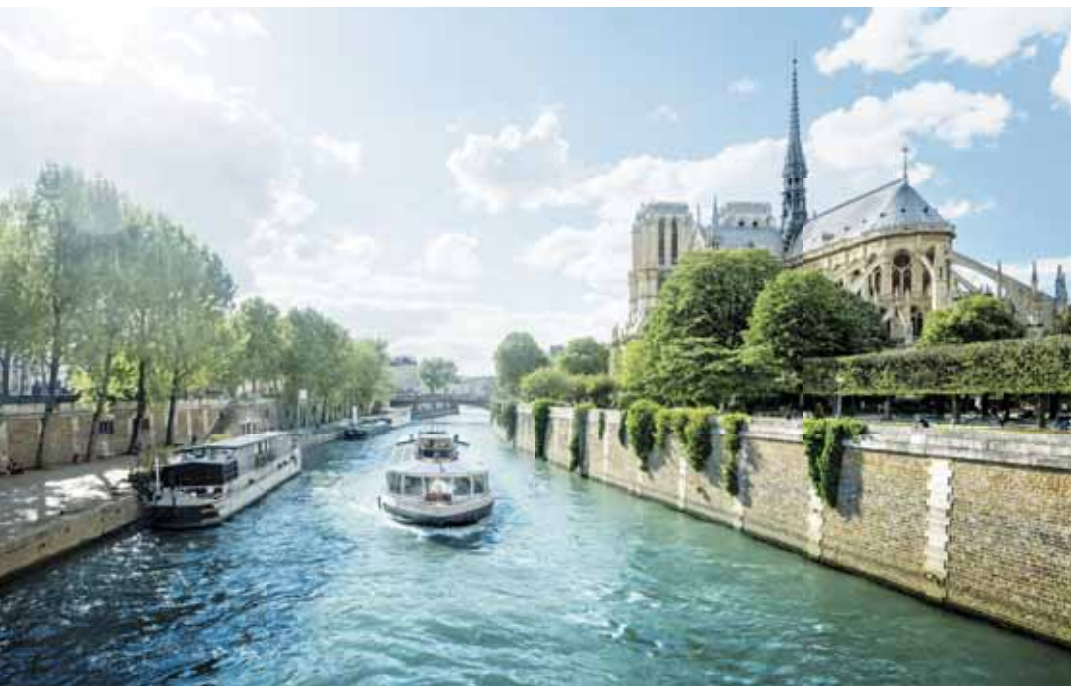
Cruising the Seine River

Discovery: The Left Bank. The African-American community, along with other communities of the African diaspora, flourished on the Left Bank. See where the Revue du Monde Noir , a groundbreaking magazine, was published, and learn about intellectuals, such as Anna Cooper and Carter G. Woodson. Born into slavery in 1858, Cooper earned a doctorate from the Sorbonne, and Woodson, who studied at the Sorbonne in the early 1900s, was a pioneer in the field of Black studies. Then delve deeper into the bebop style of jazz and the musicians who flocked to Paris to play their music. Plus, see where famous musicians, such as Miles Davis and Bud Powell, lived and performed.