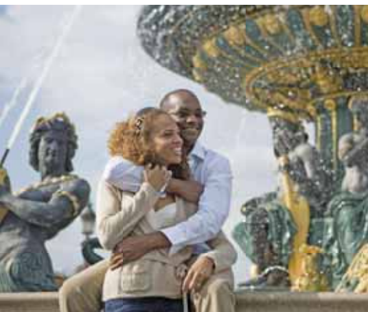
Free time to explore

🎡 Elective experiences available at an additional cost.