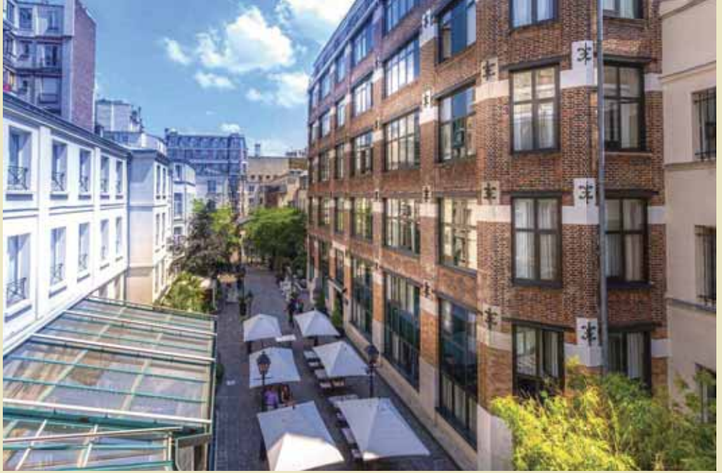
LES JARDINS DU MARAIS | PARIS