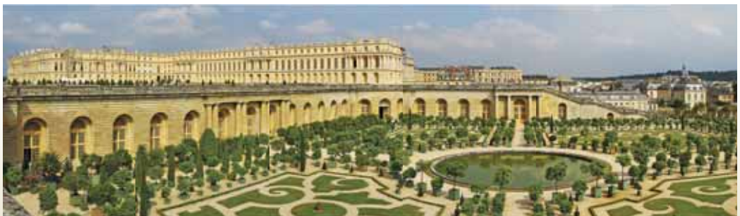
Optional excursion to Versailles