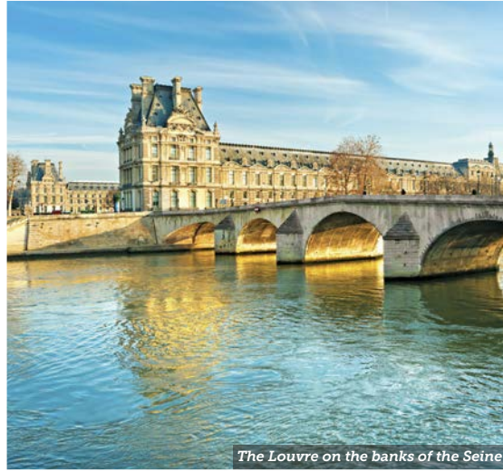
The Louvre on the banks of the Seine