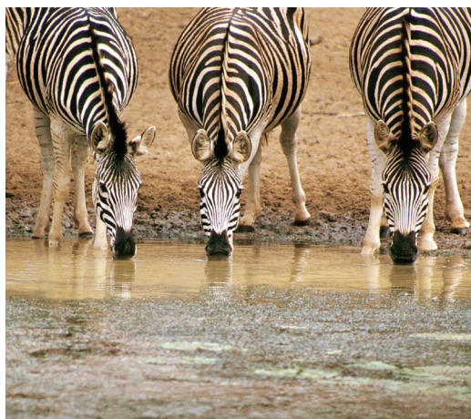
Zebra roam freely in Chobe National Park.

Day 14: Arrive U.S. We arrive in the U.S. this morning and connect with our flights home.