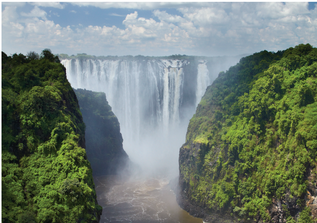
Known as the “Smoke that Thunders,” Victoria Falls is one of the wonders of the natural world.

River, where we may see hippo, crocs, and some of the park’s 450 species of birds (including the sacred ibis, carmine bee-eaters, fish eagles, and kingfishers). We dine tonight at our lodge. B,L,D