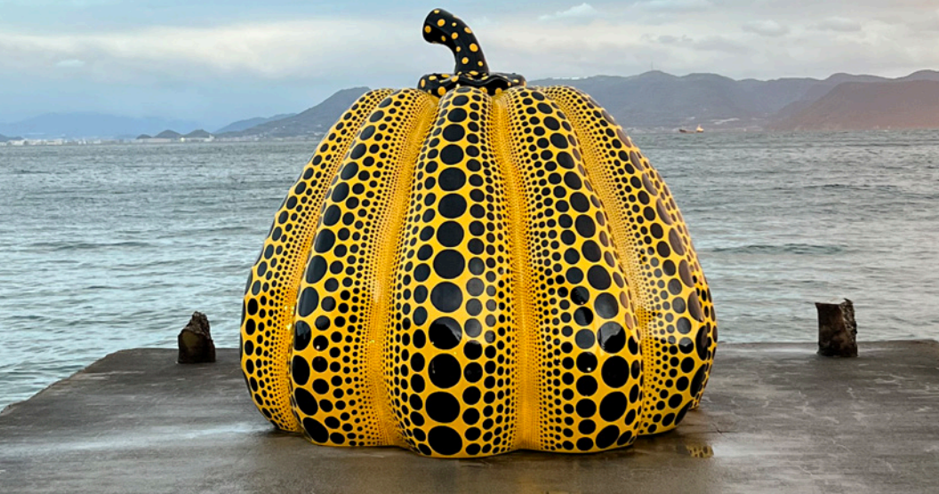
Pumpkin by Yayoi Kusama on Naoshima