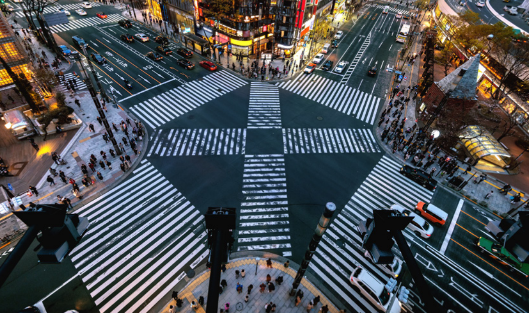
Ginza District, Tokyo