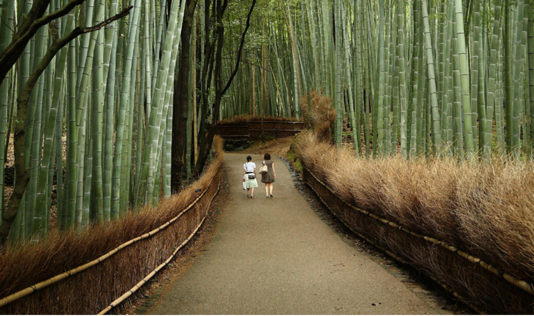
Bamboo Groves of Arashiyama