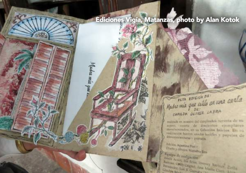
Ediciones Vigía, Matanzas