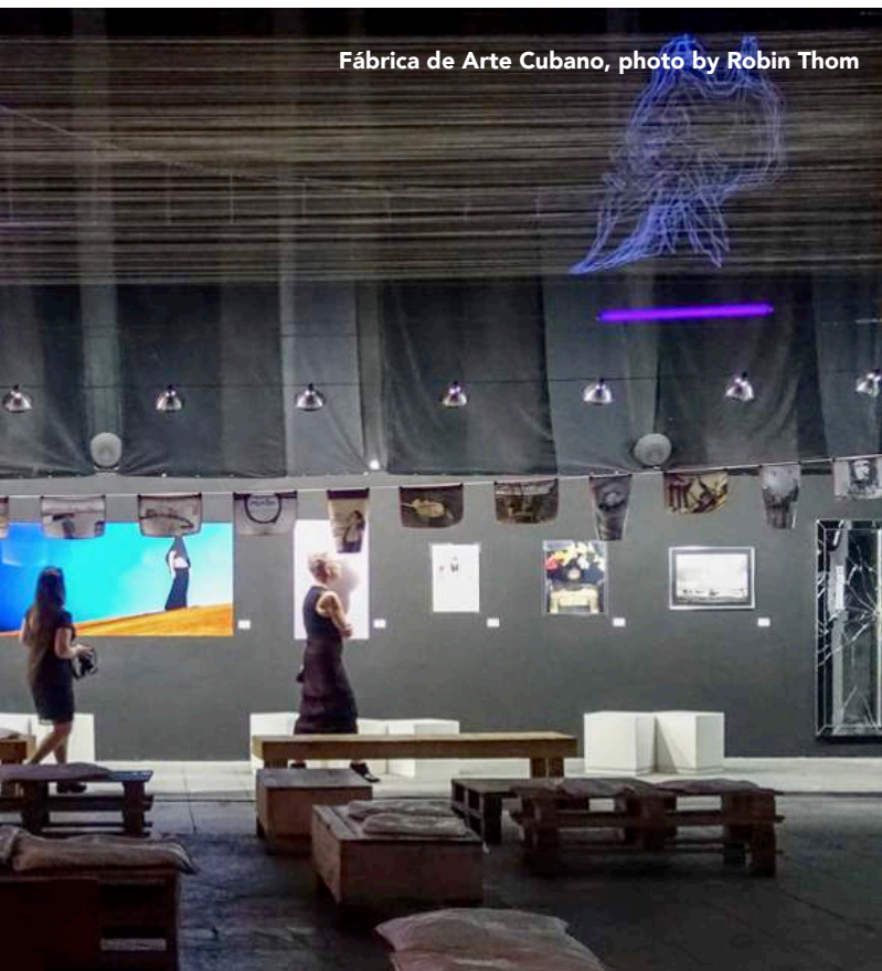
Fábrica de Arte Cubano

NOT INCLUDED IN RATES International airfare; Cuban visa; Cuban Departure tax; limited Cuban health insurance policy (required for all foreign travelers to Cuba under age 80); passport fees; alcoholic beverages other than noted in inclusions; personal items and expenses; travel insurance; airport transfers other than for those on suggested flights; trip insurance; any other items not specifically mentioned as included.