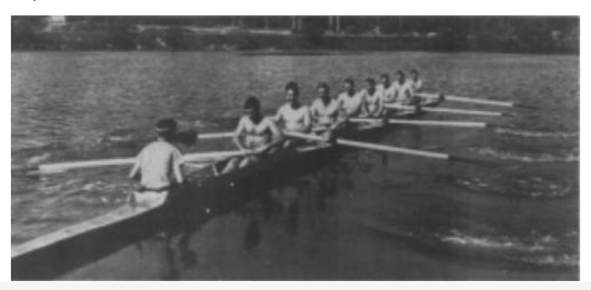
Heavyweight crew practice-rows on Schuylkill River.

Our race lineups were based on a demonic random system of employing playing cards with each rower's or coxswain's name on a different card. The cards would be shuffled and dealt making up 3 practice boats. Points earned in inter-squad races during practice determined the intercollegiate race boat lineups. Oarsmen had the opportunity to move up if they were in boats that won practice races or down if they lost. Therefore theoretically any member of the crew could be in the JV's or Varsity at any race. This separated the racers from the rowers and identified those oarsmen who were improving, or not, more readily.