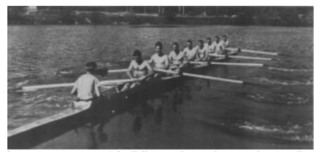
Heavyweight crew practice-rows on Schuylkill River. The crew later won the Intercollegiate Rowing Association (IRA) Regatta. Click <u>here</u> to read the entire story from The Daily Pennsylvania, 25 August 1967.

Our race lineups were based on a demonic random system of employing playing cards with each rower's or coxswain's name on a different card. The cards would be shuffled and dealt making up 3 practice boats. Points earned in inter-squad races during practice determined the intercollegiate race boat lineups. Oarsmen had the opportunity to move up if they were in boats that won practice races or down if they lost. Therefore theoretically any member of the crew could be in the JV's or Varsity at any race. This separated the racers from the rowers and identified those oarsmen who were improving, or not, more readily.