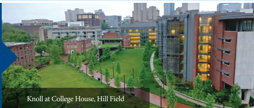
Knoll at College House, Hill Field

The morning begins at 9:00 AM with a Class Champagne Breakfast . After breakfast join classmates from 12:30 - 3:30 PM for a guided gallery tour of The Impressionist's Eye at the Philadelphia Museum of Art. Shuttle transportation will be available, leaving from 34th and Spruce Streets at 12:00 PM.