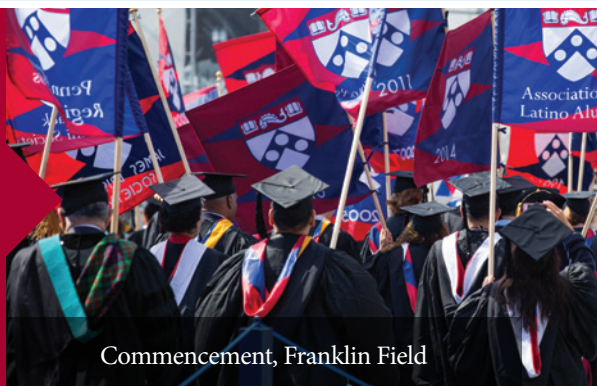
Commencement, Franklin Field