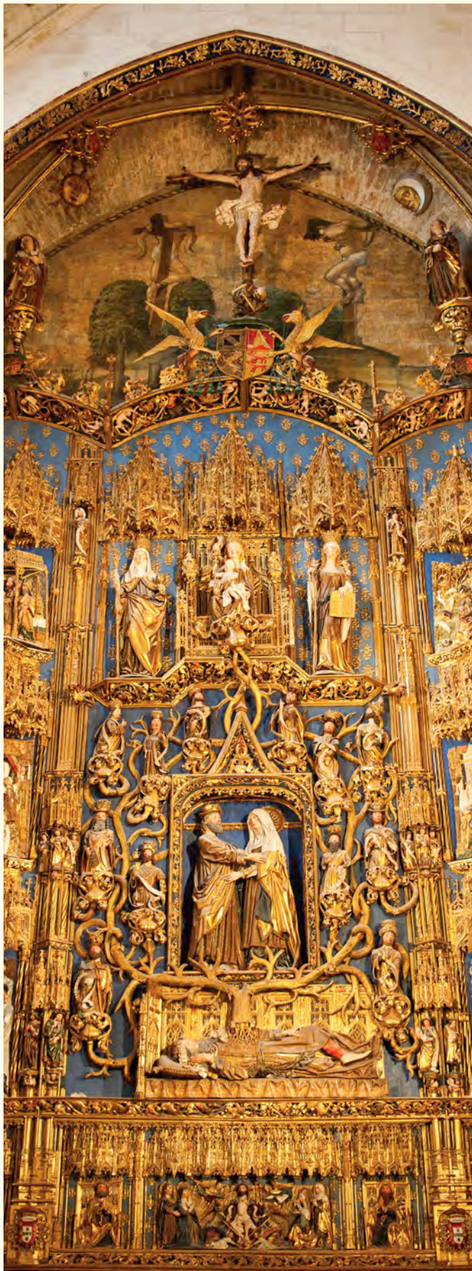
Altar (detail), Burgos Cathedral

AIRFARE Academic Arrangements Abroad (AAA) will be pleased to assist with air travel arrangements for this program, including specially negotiated group airfare when available, suggested group flights or your own individual requests for a processing fee of $40 per person. Complete details will be provided in your confirmation mailing.