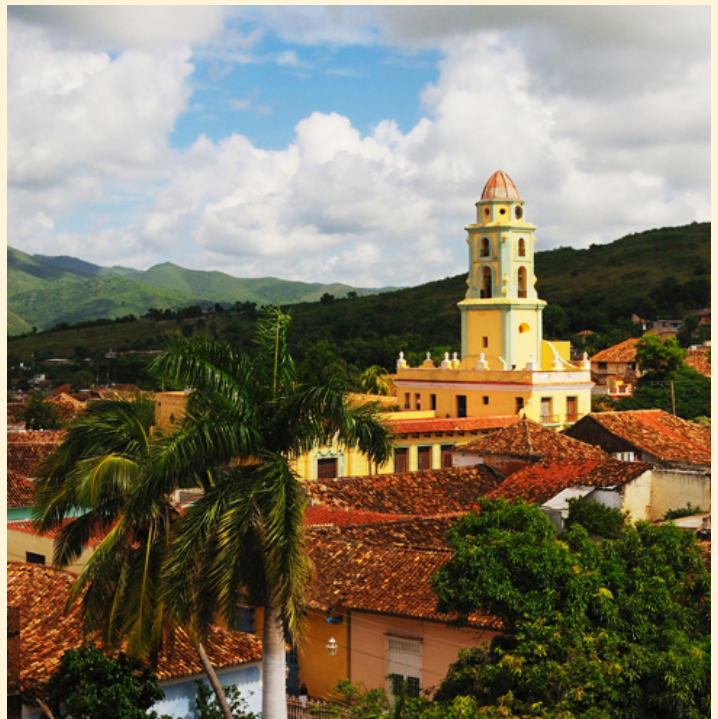
Cienfuegos (left) and Trinidad (right)