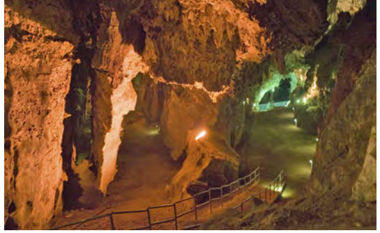
Caves Of Cradle Of Humankind

Enjoy a last wildlife run this morning and a hearty breakfast before flying back to Johannesburg via Maun where you connect with your overnight flight to the U.S.A., bringing home with you the memories of all the wonderful sights of Southern Africa.