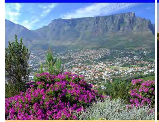
OPTIONAL PRE-EXTENSION TO CAPE TOWN

Your adventure begins with a delightful retreat in Cape Town, one of the loveliest cities in the world. View Table Mountain and take the coastal route to the Cape of Good Hope to discover charming seaside towns, spectacular wildlife, and the comical African penguins at Boulders Beach. Tour the brilliant Kirstenbosch Botanical Gardens, and spend a day in the famed Boland Valley wine region. Visit the settlement of Khayelitsha with a township guide, and get an eye-opening historical tour of Robben Island.