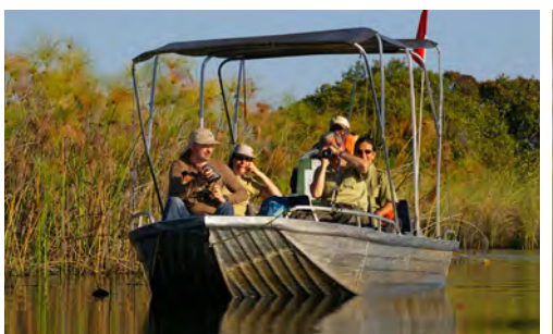
Observing the bounty of African wildlife on the water.