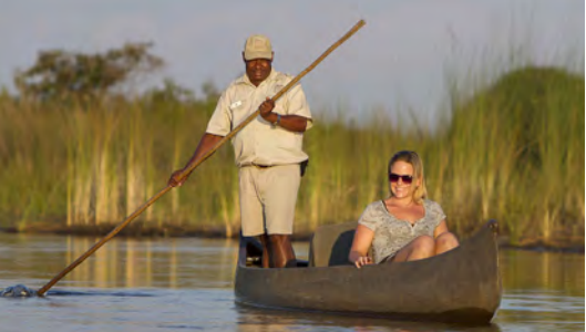
Gliding through the Okavango Delta in a mokoro canoe.

Did you know ... Batswana is the plural term for people who live in Botswana. The singular term is Motswana.