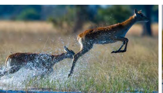
Lechwe in the wetlands.

Fly to one of the world's most distinctive regions and largest inland water systems, the Okavango Delta and to the exceptional Camp Okavango