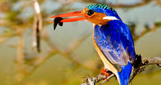
The jewel-toned Malachite Kingfisher enjoying breakfast.